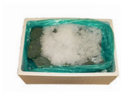
Thermo box on ice